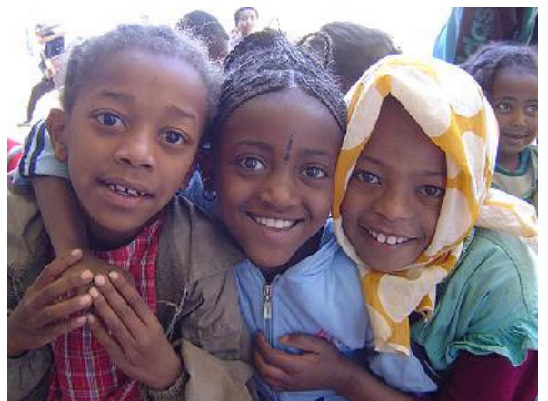
Girls in one of Hope for Children's schools.

Overall we are very pleased with Hope for Children and have no doubt in the necessity and reliability of the work of this NGO.