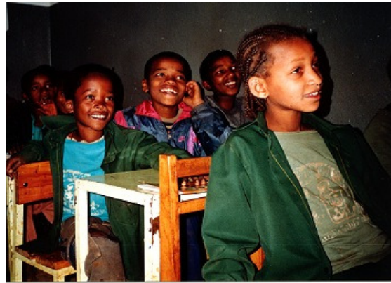
Many children are misused as labour force before they join Hope for Children's program. After that their working hours decrease dramatically and they start going to one of Hope for Children's school.