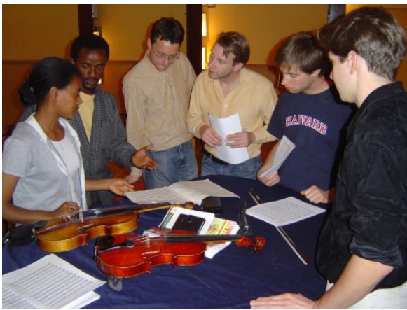
Up to 14 hours a day: German and Ethiopian musicians work together (Above with music students and below with the Gospel choirs)