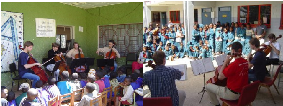
Concerts of the Berliner Cellharmoniker for children at Hope for Children's school (left) and German Church School (right)

never seen before. On several occasions the Berliner Cellharmoniker spontaneously played for children. They played in one of the schools from Hope for Children, in the