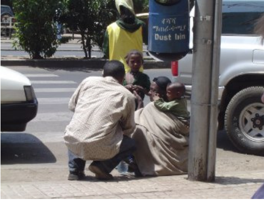
A first contact between Hope for Children and street people.

Also health education is an important part in the work of Hope for Children. A main focus in this is on HIV/AIDS prevention but also educating people about family planning and other health problems. Children who get support from Hope for Children