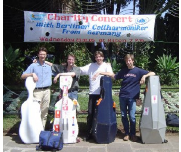
Ahead of the first concert in front of the Hilton Hotel

The concert at the Hilton Hotel also offered a platform for Hope for Children to make new contacts and to present its work to potential sponsors and partners. The Hilton, as one of the most exclusive hotels in Addis Ababa, was very suitable for this purpose. The audience was made out mainly by the international community of Addis Ababa. Many were representatives from embassies and influential organisations. A total of 142 guests came to listen to the concert. The intense preparations of the